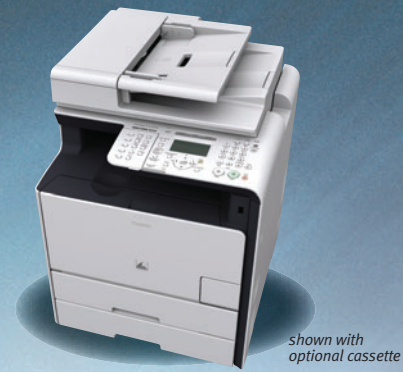
Shown with optional cassette

DUPLEX PRINTER DIGITAL COPIER SUPER G3 FAX COLOR SCANNER NETWORK CAPABILITIES